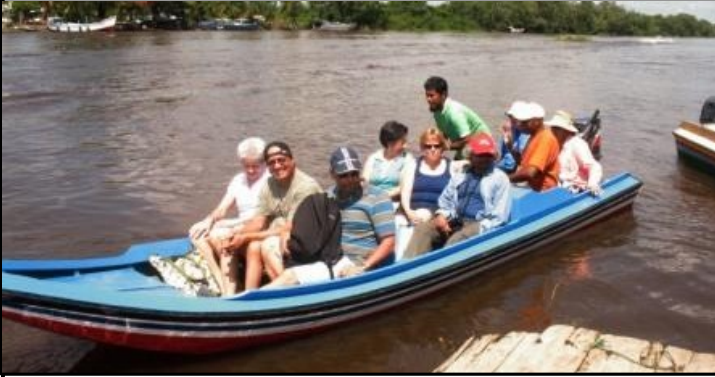
Leaving Charity in a speed-boat

We crossed rickety bridges over forest creeks and saw some of the flowers and birds and insects of the region. For me, it was a long time since I'd walked through a tropical forest and I thoroughly enjoyed the experience which