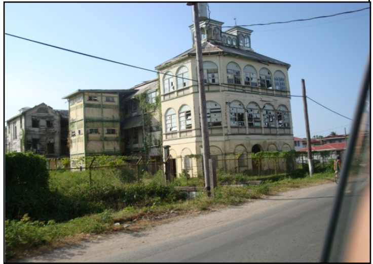
Old NA hospital, falling into ruin

The next reunion event was a trip to Bounty Farms at Timehri, the Fernandes' property which has a great facility right at the back: a long thatched shed with tables and chairs and bar and kitchen facilities, plus changing rooms for the large swimming pool that is adjacent. It is a black water pool, fed by the Madewini creek system of the area - cool and refreshing. There we had lunch and swam, but the highlight for me was a walk along a forest trail behind the facility. We were guided by David Fernandes who is very knowledgeable about forest flora and fauna.