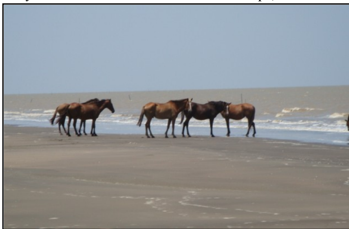
Horses at the sea's edge on #63 beach, Courantyne

Then, quite suddenly (it seemed to me), we were at the new Berbice River bridge: a long, flat floating structure, not unlike the one across the Demerara, but newer (and meaner, in the sense that there was no pedestrian walkway - vehicular traffic only).