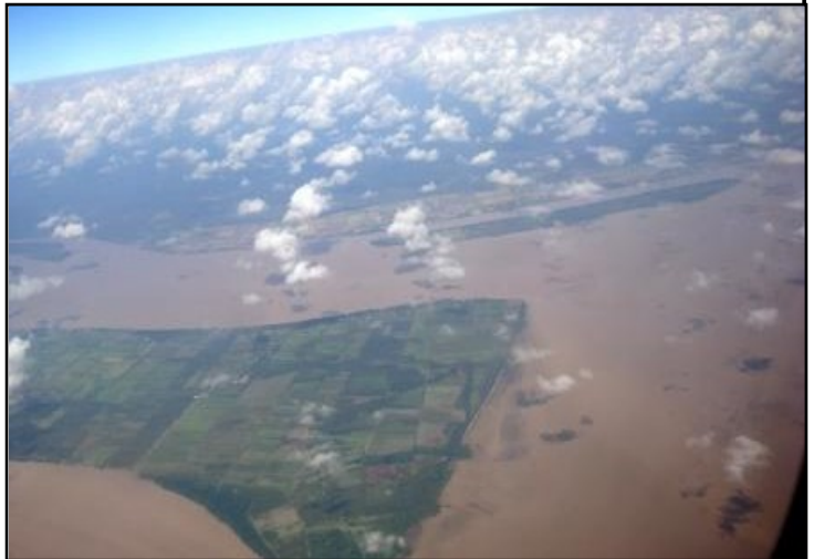
Essequibo islands from the air...