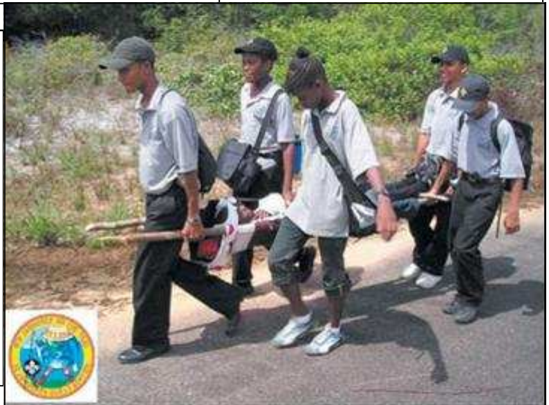
Saint Stanislaus College Scouts perform an Emergency First Aid drill during the recent 'Jamboree on the Trail' exercise

The Scouts of St Stanislaus College chose as their in-