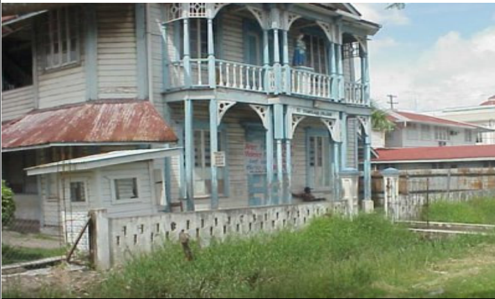
End of the Old and Start of the New. The new wall starts where the original one ended and the hedge began