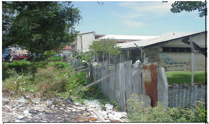
Hadfield Street and Manget Place—the old 'zinc' fence and the new one taking shape. Note the increased height of the new fence