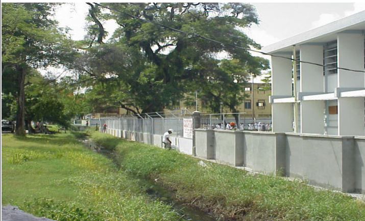
The Wall extends on Brickdam from the main entrance to the end of the Hopkinson Wing, where it meets the security fence.