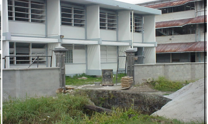
The new main entrance, wider and with new gates and a concrete driveway