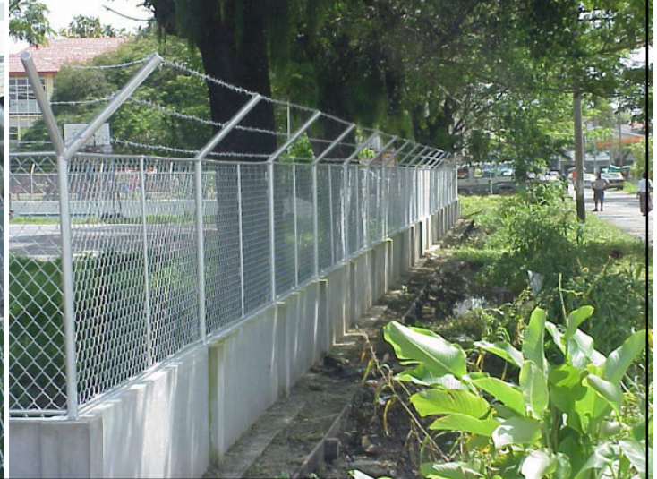
Finished sections of Hadfield Street (Left) and Manget Place (Right)