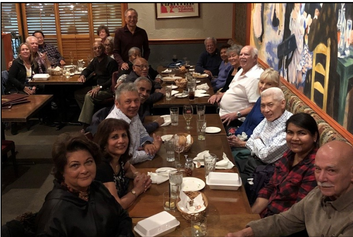
(Seated clockwise from bottom left)