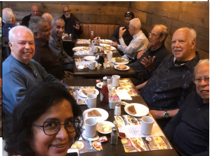
(Seated clockwise from bottom left)